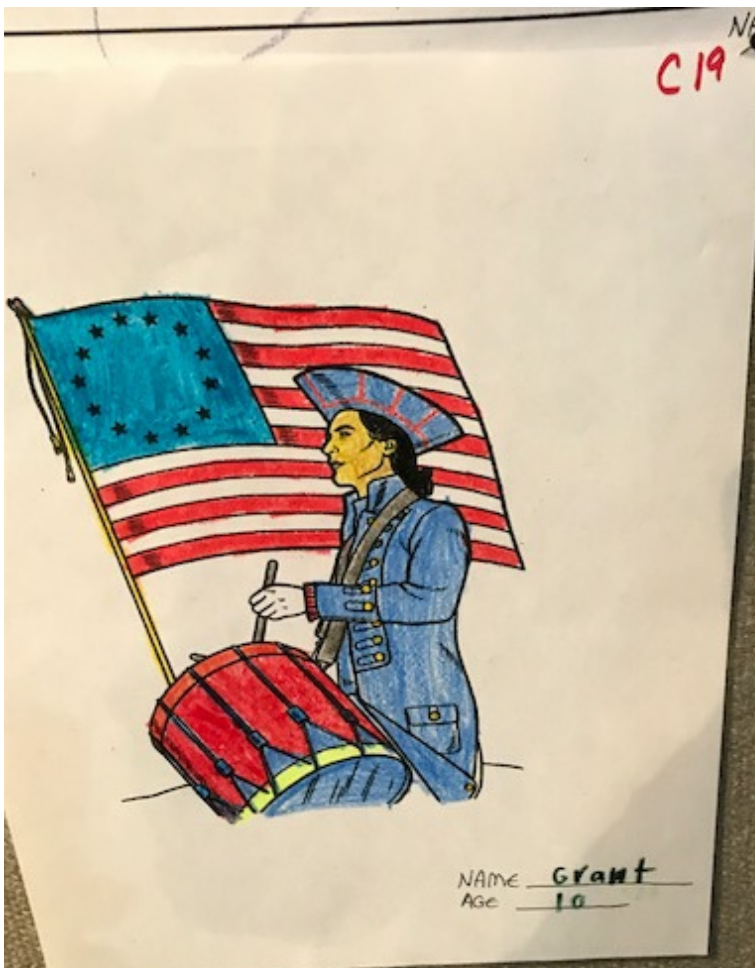
GRANT YOUNT'S WINNING COLORING PAGE