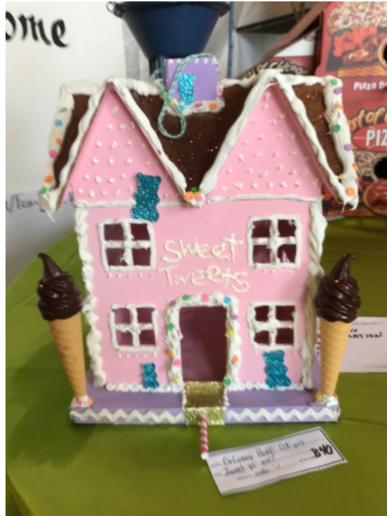
"SWEET TREATS" BY DELANEY HUFF