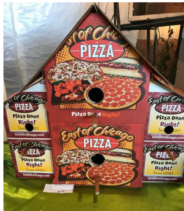
EAST OF CHICAGO PIZZA BOX BY EOC