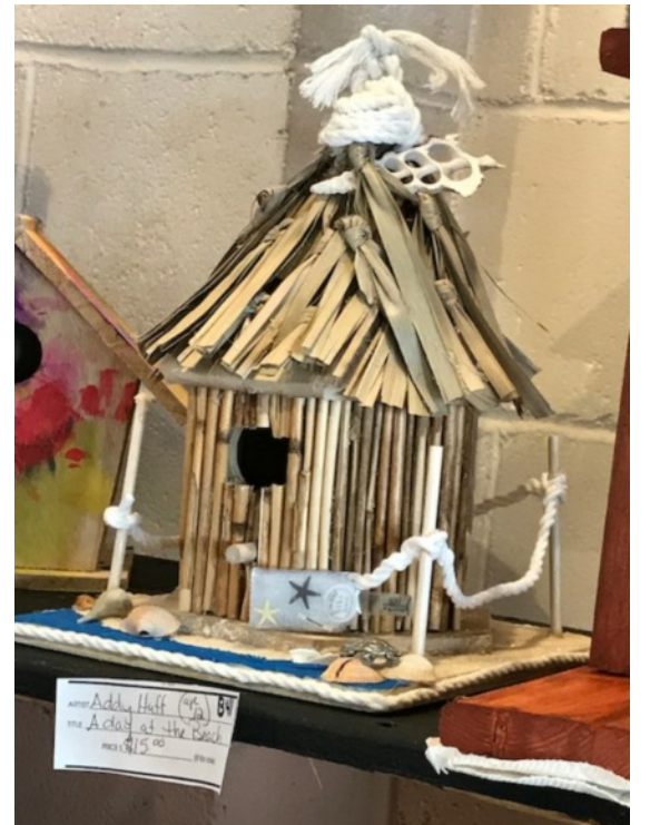
"A DAY AT THE BEACH" BY ADDY HUFF