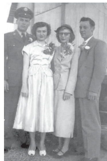
The Wedding Party in 1952