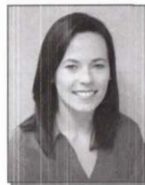
Warren Family Dentistry 470 Bennett Dr. Suite C • Warren • 375-2246