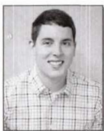
Warren Dental Clinic 470 Bennett Dr. Suite A • Warren • 375-2626

In 1980 Decatur Dental Services was founded, and over the past 35 years has grown to include 5 satellite locations; Geneva Dental Clinic, Bluffton Dental Clinic, Berne Dental Clinic and our new locations, Warren Dental Clinic and Warren Family Dentistry. We offer a wide range of dental services, including preventative, cosmetic, restorative, and orthodontic treatments.