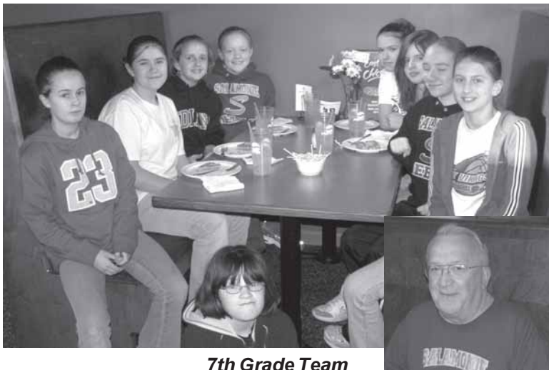
7th Grade Team