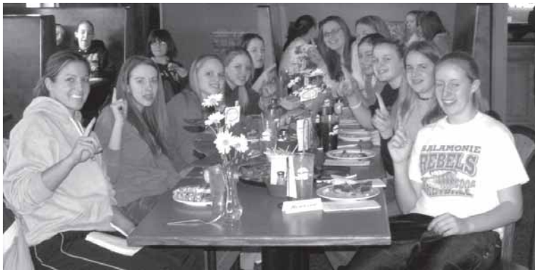
8th Grade Team

Thought for the Week: Happiness and moral duty are inseparably connected. George Washington