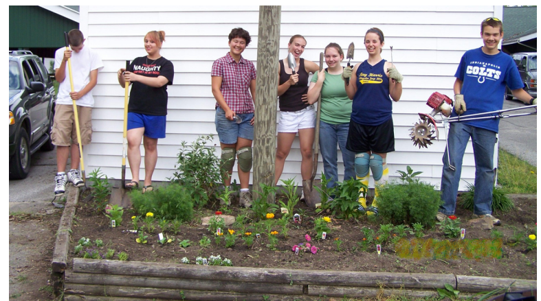
COUNTY JUNIOR LEADERS PLANT FLOWER BED AT HIER'S PARK

Warren Weekly News & Advertising Deadline Tuesdays @ 10 a.m.