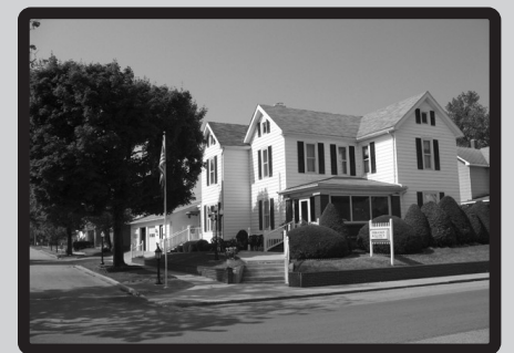
FERGUSON & GLANCY • Van Buren 765-934-2211