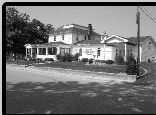
H BROWN & SON • Warren