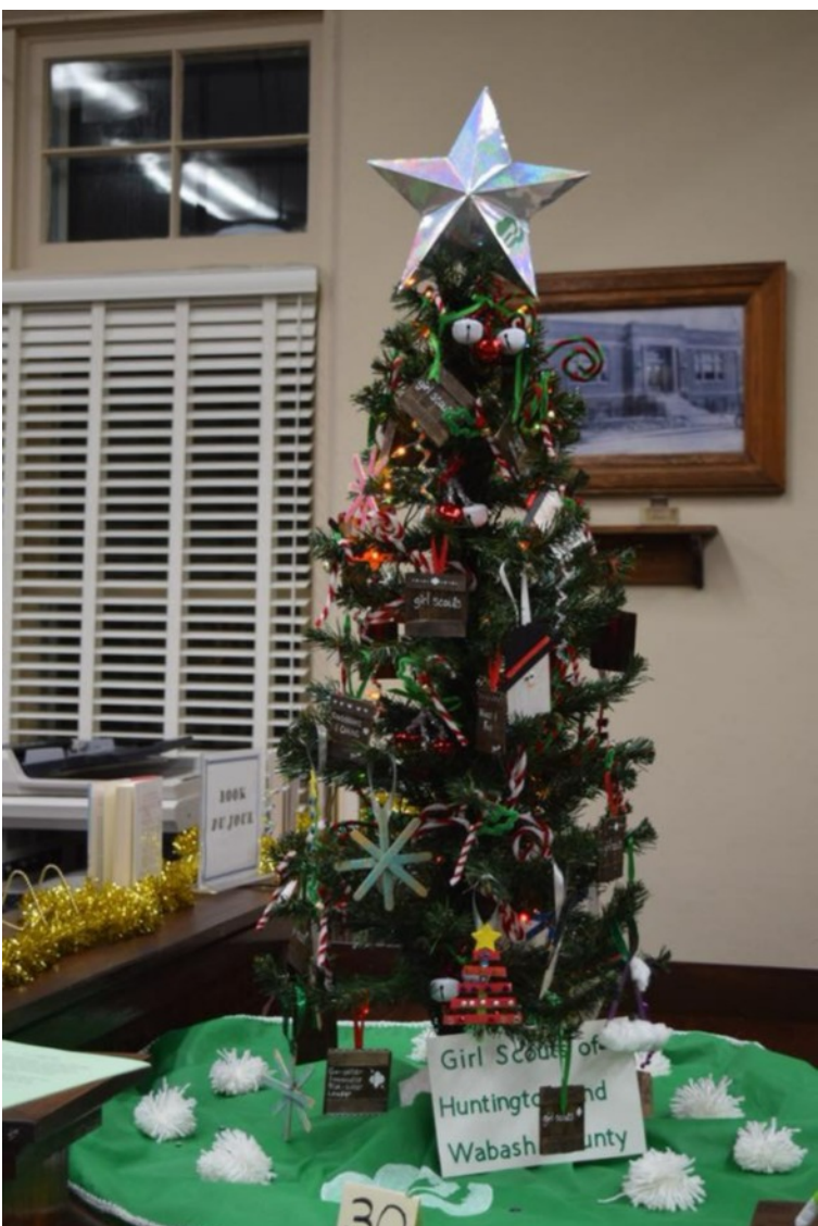
Youth Organization: Girls Scouts of Huntington-Wabash Co.