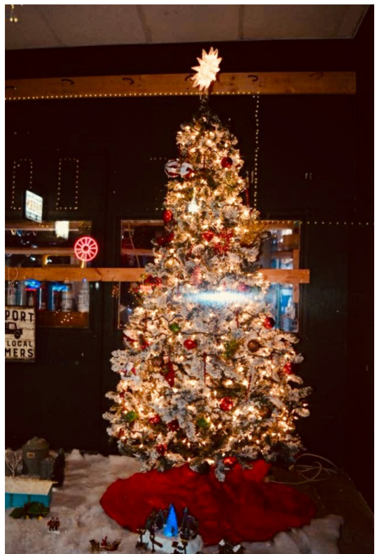
Miss Warren Queens Choice: Crop Production Services