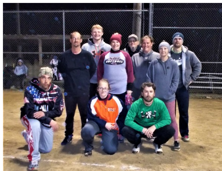
S&S Bait & Tackle