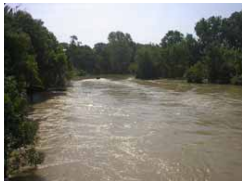
The Salamonie River on July 8

on the hill were grateful for the volunteer firefighters who gave their time to help out. When the firemen and woman, weren't spraying down the field they turned the hoses on the kids in the crowd to cool them off.